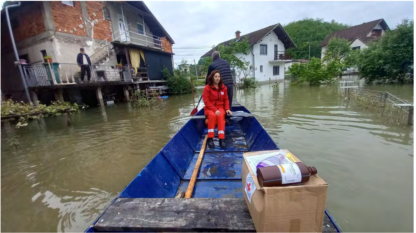
The National Society volunteers distributed humanitarian aid in the aftermath of floods